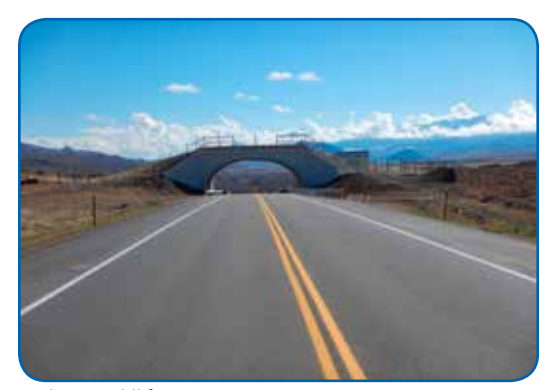
Highway wildlife overpass

If you have questions about the project, please leave a message on the project hotline or email us. You will receive a response within 24 business hours.