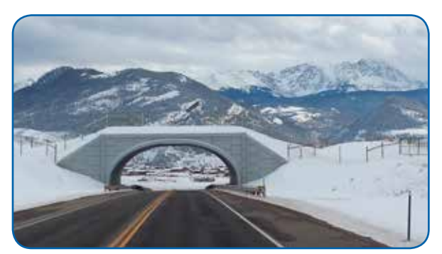
Highway wildlife overpass

From 2007-2011, a total of 133 vehicular accidents were reported along this section. CDOT data shows the majority of the reported accidents (47 in total) were vehicular-wildlife collisions. Information from the Colorado Division of Wildlife reported an average of nearly 60 annual wildlife mortalities on the same stretch of road for that time period.